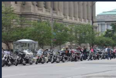
Motorcycles lining up for Cops Ride Motorcycle Rally starting at the memorial and ending at Lake Erie Harley Davidson, Avon, Ohio held on June 24, 2018 proceeds benefitting GCPOMS.