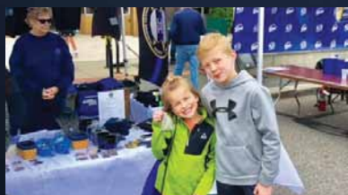
Young folks enjoy the GCPOMS Merchandise Sales Tent at the WestPark Hooley in May 2018.