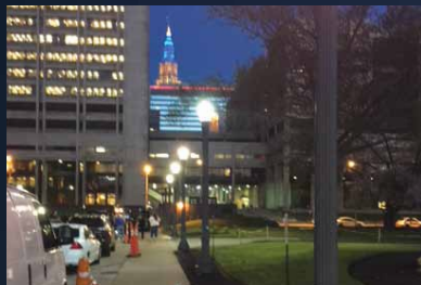
The Terminal Tower as seen from the GCPOMS Memorial. Light Northern Ohio Blue for Police Week May 12-20, 2018