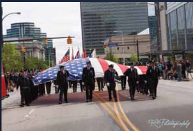
The American flag is proudly carried in the GCPOMS Memorial Parade by peace officers from Northern Ohio and Canada.