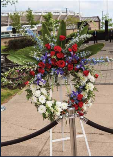
A memorial wreath was placed at the GCPOMS Memorial to Honor Our Fallen