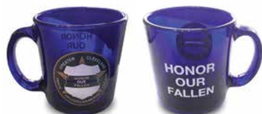
GCPOMS Blue Glass Memorial Coffee Mug

We invite you to shop our online Memorial Mini-Market and select from the many memorial items to help GCPOMS Keep the Promise to Never Forget our Fallen Heroes who made the ultimate sacrifice protecting the communities they so valiantly served.