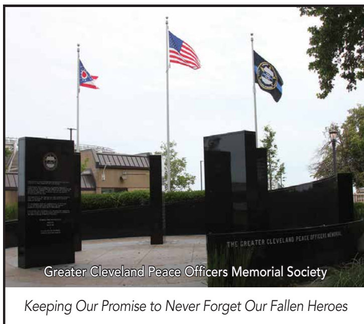
Greater Cleveland Peace Officers Memorial Society