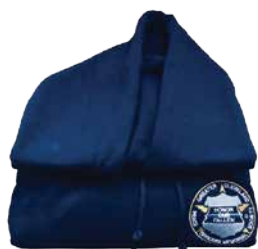
Navy Embroidered Hoodies