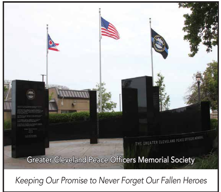
Greater Cleveland Peace Officers Memorial Society

Since becoming president of this great organization, we have made several meaningful changes. First and foremost, we are growing. After careful board discussions and meetings, the Greater Cleveland Peace Officers Memorial Society has expanded its region to include Portage County. Each year, officers from many Portage County police departments attend our Memorial events, parade, and service. We are honored to officially welcome Portage County Law Enforcement Agencies into our organization. Portage County has lost four officers in the line of duty, and we remain steadfast in ensuring their sacrifice is never forgotten.