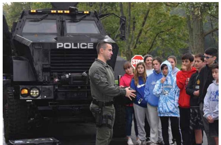
Wickliffe MRAP vehicle.