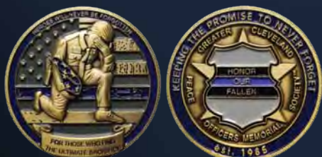
New Challenge Coins have arrived (Front and Back of Coin).