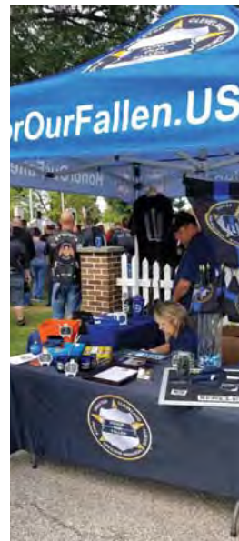
GCPOMS Tent Sale at Veterans' Memorial Ride, September 9, 2019.