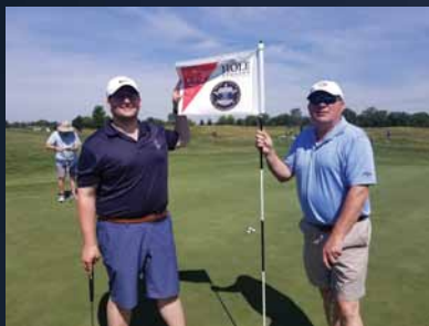
GCPOMS Sponsored a Hole at the Tony Rizzo Golf Outing.