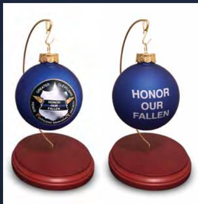
Honor Our Fallen Holiday Ornament (stand available separately)