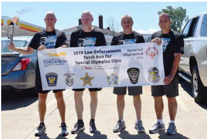
Wickliffe PD supports the Special Olympics.

Community policing emphasizes all ages of community residents. The WPD Officers participate in the Bike Rodeo which includes two and three wheeled