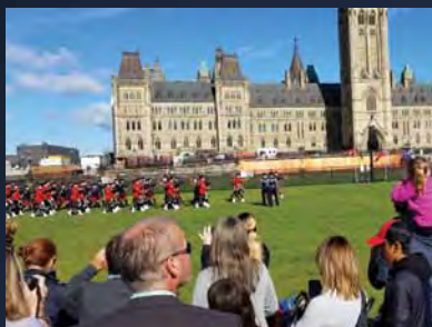
Canada Memorial Ceremony to Honor the Fallen, at Ottawa September 2019.