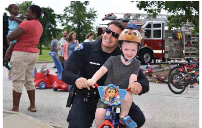
Wickliffe PD sponsors the Bike Rodeo for all ages.

the City of Wickliffe. The WPD Mission is to “provide the public with effective and professional law enforcement while treating all people with dignity and respect”.