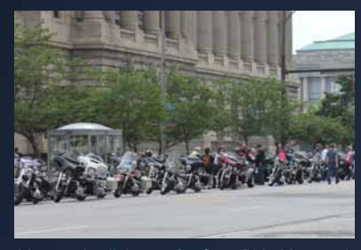
Motorcycles lining up for Cops Ride Motorcycle Rally starting at the memorial and ending at Lake Erie Harley Davidson, Avon, Ohio held on June 24, 2018 proceeds benefitting GCPOMS.