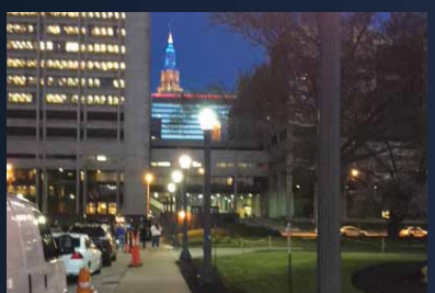
The Terminal Tower as seen from the GCPOMS Memorial. Light Northern Ohio Blue for Police Week May 12-20, 2018