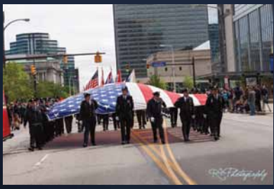
The American flag is proudly carried in the GCPOMS Memorial Parade by peace officers from Northern Ohio and Canada.