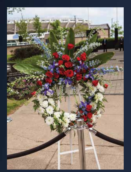
A memorial wreath was placed at the GCPOMS Memorial to Honor Our Fallen